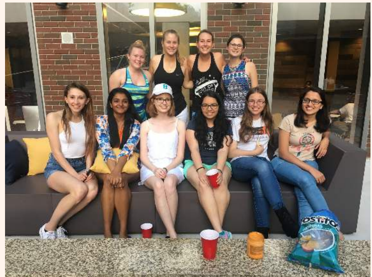
SWE Mentors and Mentees hanging out at the Summit Courtyard

The third event we hosted was May 17th, at this event we hosted a simple hangout night at the Summit courtyard. The weather was perfect for this event, we had plenty of chips, salsa and pretzel bites for the girls to munch on while they chatted. We had about 12 girls show up and at this event we had a very large number of freshman which was excellent to help the girls network and encourage them to become a chair member of the group.