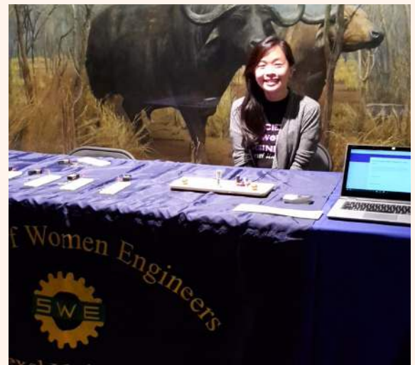
SWE table at the STEM Career Day

On May 22nd, we had a table at the Academy of Natural Science's STEM Career Day sponsored by Pfizer! There, we introduced our organization to about 350 middle school students from around the Philly area and taught them about making their own simple circuits.