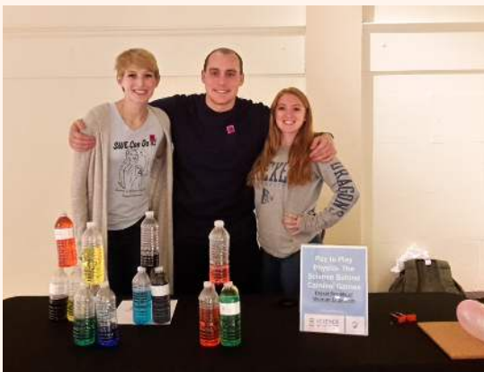
Exploring the physics of carnival games with Bottle Towers

On April 21st, Drexel SWE volunteered at the Franklin Institute's Science After Hours: Prom! This special Science After Hours event kicked off the week of the Philadelphia Science Festival. With a full house, our volunteers taught guests about optical illusions and solved the mystery of the true color of "the dress".