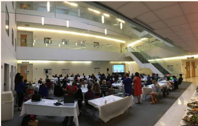
Six diverse panelists speak as underrepresented STEM

Drexel's first Lives & Lessons of the underrepresented in STEM event, hosted by SWE and COE with the help of NSBE and LSAMP, was a wonderful success! Six diverse panelists of all different genders, races, religions, nationalities, ages, disciplines, and backgrounds shared their personal stories of suffering and triumph. They gave advice on how to thrive in academia and industry and how to recognize and remedy unconscious biases. Women and minorities learned the importance of mentorship and staying focused on what inspires instead of what hinders. Attendees learned that it's essential to motivate one another to speak up about the challenges they face and to never give up on STEM. When this dialogue is created, people learn so much about each other and themselves, and the collective pursuit of equality grows stronger. Attendees were so thankful for the Lives & Lessons event and expressed how it helped the way they view their own situation as well as the challenges of others. The panelists were thrilled to have participated and hope this effort is continued moving forward. With great food, conversation, information, and inspiration, over 70 students, alumni, faculty members, and professionals left feeling more empathetic and more motivated to advocate for change and equality on Drexel's campus and beyond.