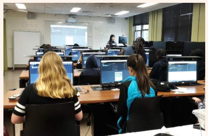
16 girls building their own website at the TechGirlz workshop