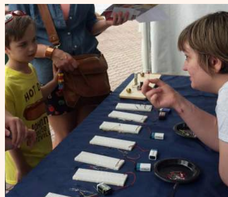
Teaching participants about electric resistance at the Carnival

On April 29th, to finish off the Philadelphia Science Festival with a grand finale, Drexel SWE volunteered with the Philadelphia SWE Section at the annual Philly Science Carnival! With over 55,000 visitors at Penn's Landing, we taught participants of all ages about electrical resistance and made great connections with other STEM organizations.