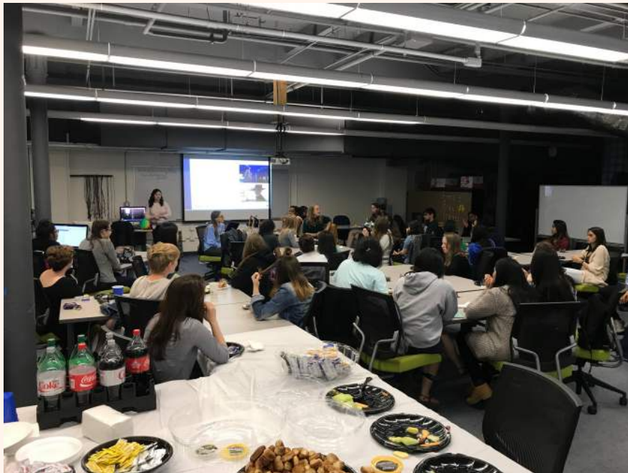
SWE members enjoying dinner and discussion at a GBM

Our 2nd GBM was on May 3rd. As the Lives and Lessons of the Underrepresented in STEM event was on the horizon, our members present got even more excited about what was to be offered at that event as well as others that were coming up, such as a Self Defense Class and a Board Game Night (both successes!). We also networked with Drexel's new Peace Engineering Program, and that portion of the GBM engaged many of our members into such a unique avenue an aspiring engineer can take.