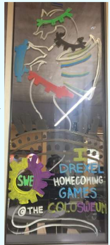
Window results weren't announced- we assume we got 1st!