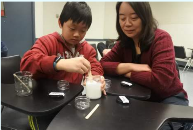
Mother and Son bond while making some lotion

On February 3, Drexel held the Materials Science & Engineering Day, a showcase of various activities and demonstrations of the wonders of Materials Science! SWE had sessions going on throughout the day where we taught all the attendees to make lotion. Making lotion is very simple, it just takes water, oil, and something to bind the two: an emulsifier. The young students were able to see the emulsion occur right before their eyes, plus they got to take some homemade lotion home!