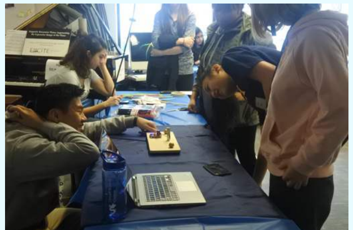
Girls watch a demo showing what electrical engineering is all about!

Drexel had their annual Introduce a Girl to Engineering Day on February 24. This event is always super fun for both us college students and the girls who attend. Different engineering organizations from across Drexel came together to create an event that showcased all different types of engineering. SWE had Electrical and Mechanical Engineering demonstrations, where we taught attendees how to use breadboards, how to make some aerodynamic, and we showed them that their own bodies can carry current. The girls had so much fun at table at the event!