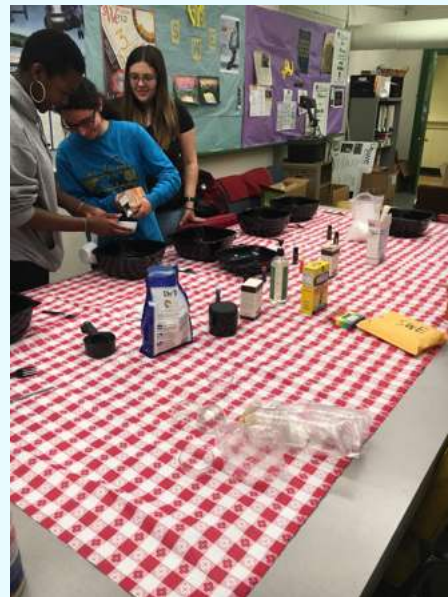
Mentors/Mentees bond while making bath bombs from scratch

On February 7, the networking committee hosted a dinner for the members of the professional mentorship program. It was an Italian pasta night catered from Maggiano's Little Italy. 20 mentees and 3 professional mentors attended the event and they all got the opportunity to talk about their favorite memories at Drexel. Moreover, mentees got resume tips and advice from mentors. The night of networking concluded after two hours and members said they are looking forward to similar events in the future.