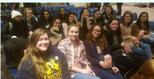
Members at the Variety Show - SWE got bronze!