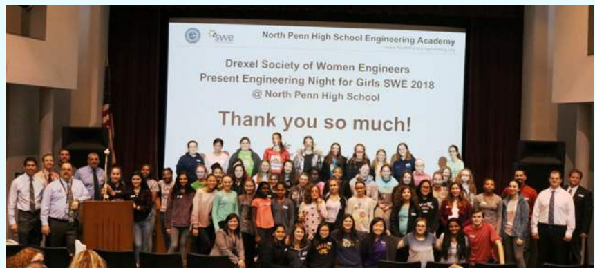
North Penn STEM students and faculty learn about the different engineering fields

Engineering Night for Girls was held on February 13 at North Penn High School in Lansdale Pennsylvania. The goal of this event was to co-host an event alongside the North Penn STEM department that would introduce middle school girls to engineering. SWE had members come to run four different demos, focusing on mechanical engineering, electrical engineering, chemical engineering, and civil engineering. The middle school students had about 25 minutes to rotate through each of these demos, where SWE members would explain, show, and then help the students in the completion of the demo. At the end of the night, everyone came back together for a good final presentation and group photo!