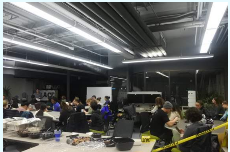
Members enjoying some dinner and company as they learn about the different SWE committees

Our final event of the term was Spa Night, which was a collaboration with the Wellness committee. As finals week approached, this event aimed to promote mental wellness and provide the members a chance to relax and spend time with one another. Members enjoyed waffles, colored, and did face masks, all while taking a break from studying and getting to know other members better.