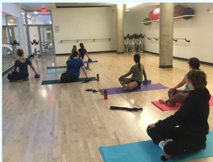
SWeeties relax and meditate during yoga