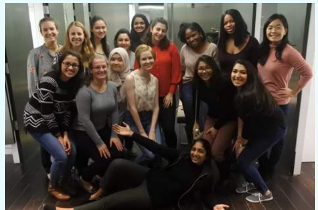
SWEeties strike a pose after a spree at Loft

We collaborated with LOFT to conduct a professional attire workshop. It was a fun way for members to learn how to dress for co-op interviews and an everyday work setting. The event was held at the LOFT in Center City on January 13th where LOFT hosted us with different styles picked out for every color pattern and occasion. After some fashion advice, members were able to walk around and browse for items, those who wished to purchase anything were offered a discount code or snagged a great deal!