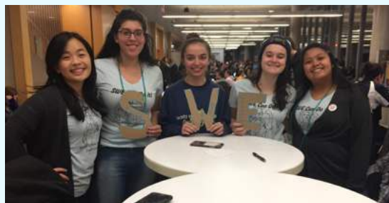
Our Quizzo team came in 2nd place!