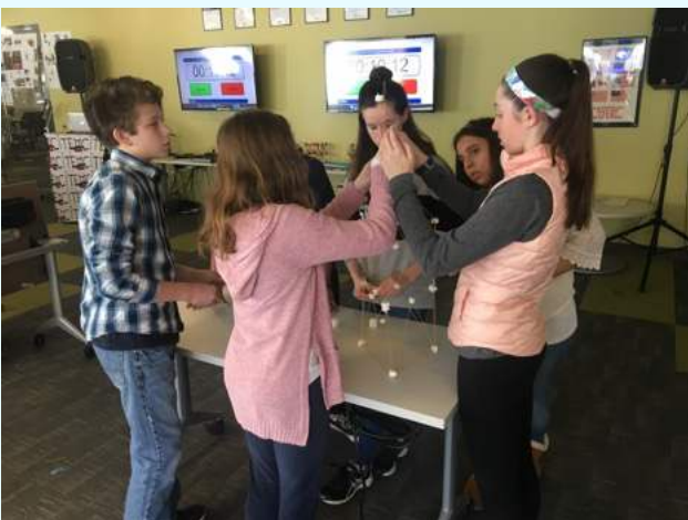
Students work on a robot controlled by hands

For this event on February 17, SWE teamed up with Lockheed Martin to provide an introduction to varying engineering fields, namely Civil Engineering, Electrical Engineering, and Mechanical Engineering. Engineers from Lockheed Martin gave a presentation on the company and what it is like to be working there in Robotics and in Biomedical Engineering. Afterwards the students had the opportunity to do the rotations of activities, including a special demonstration by the Lockheed Martin engineers about robots controlled by your own hands. Overall, the students learned a lot and gained some insight into real world engineering.