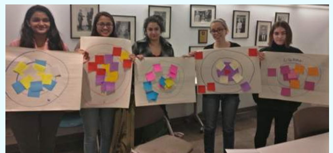
Showing off short and long term goals