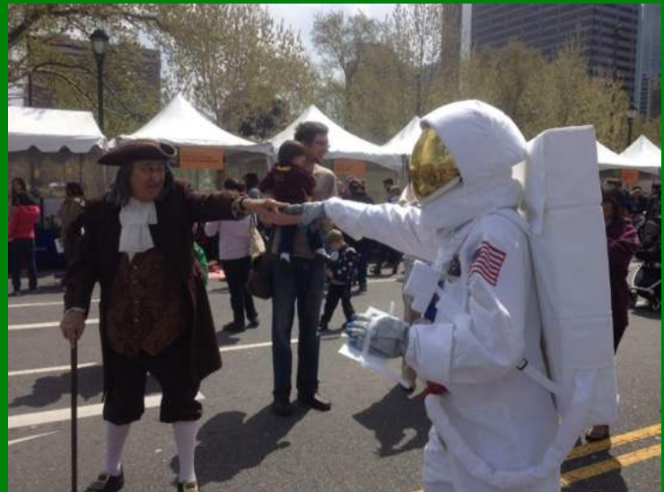
Benjamin Franklin and Neil Armstrong