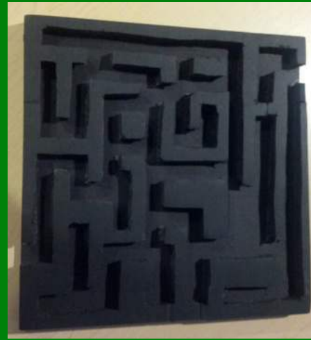
A steel ball is run through the tilting maze

The Philly Robotics Expo is an annual event in which local robotics teams join Drexel and UPenn robotics groups to showcase their work and celebrate the robotics field. For the second year in a row, Drexel SWE took part and hosted a table to talk to young students about engineering and their role within it.